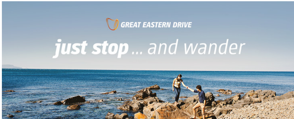
BICHENO TOWN MAP

Find out more on eastcoasttasmania.com.au