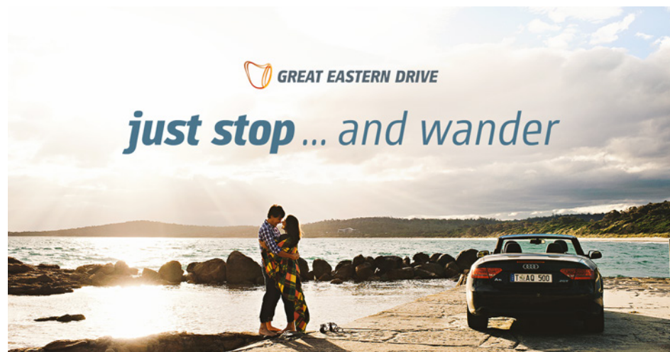
COLES BAY TOWN MAP

Find out more on eastcoasttasmania.com.au